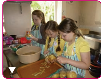
1st Eaglescliffe Brownies get back to basics on Brownie Holiday.