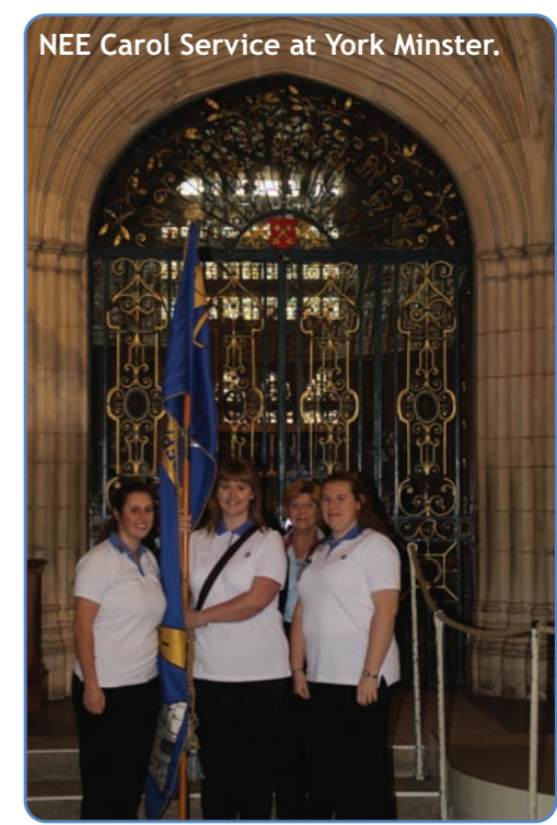
NEE Carol Service at York Minster.