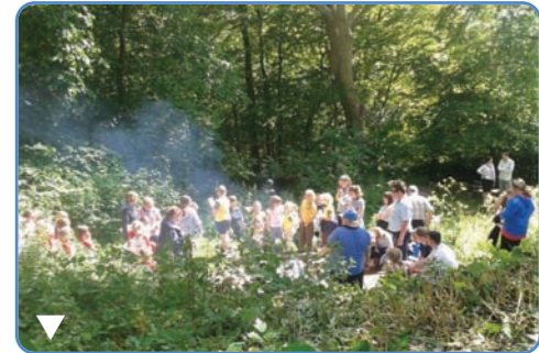
Hartlepool Brownies take part in the Egton Open Day.

If this doesn't say Guiding... what does?