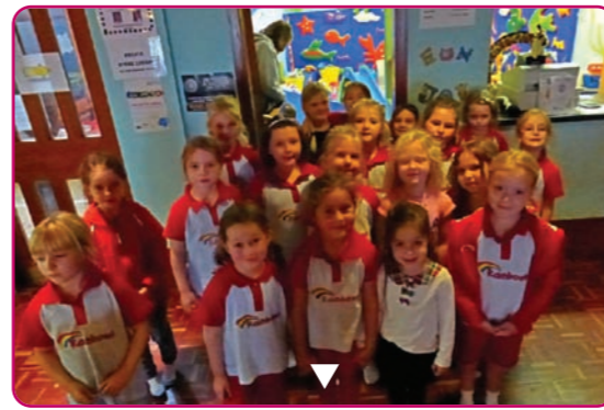
Stockton Division Rainbows enjoying a morning at Noah's Ark family centre, Thornaby.