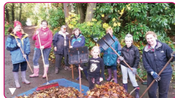
Annual gardening day at Egton.