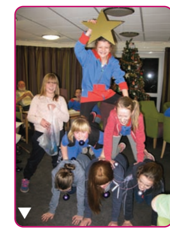
8th Redcar Guides entertain at Anchor Lodge.