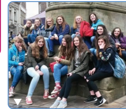
BP Monopoly challenge in Durham.