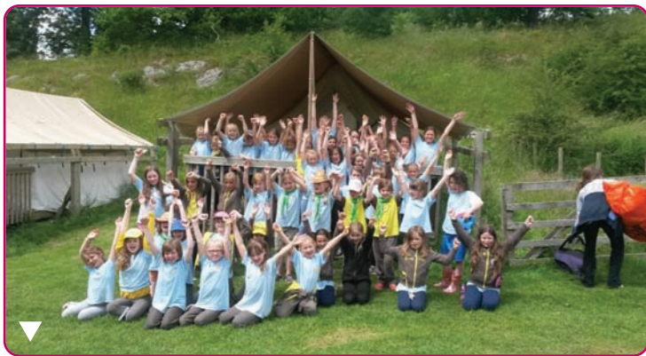
South Langbaugh Brownies spend a weekend at Wadow tented village at their Wild West themed division camp.