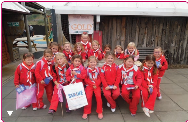
Guide and The Senior Section from South Langbaugh visited Yorkshire Outdoors and had great fun quad biking, off roading in Landrovers and on Segways.