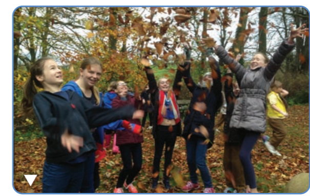
Do we really have to pick up all these leaves we would rather have a dance with them.