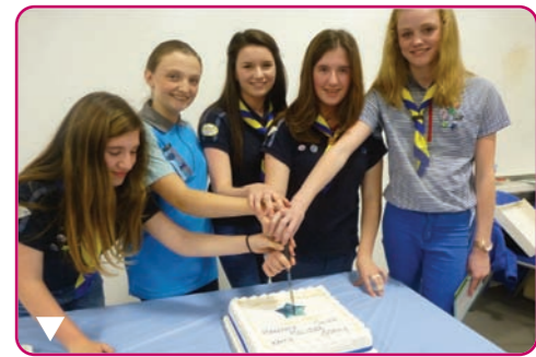
34th Hartlepool Guides receiving their BP awards.