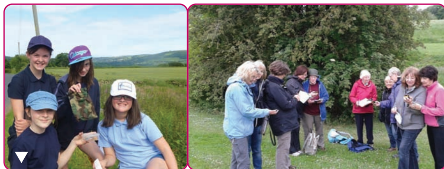
You're never too young or too old to enjoy Geocaching.