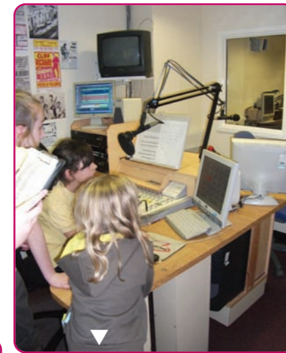
Brownies taking over the hospital radio station at North Tees hospital in Stockton.