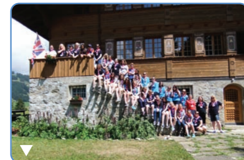
Middlesbrough Visit Our Chalet in Switzerland.