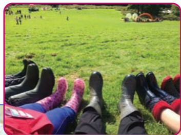
Wrist Band and Wellies Camp.