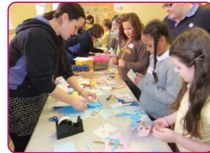
Middlesbrough Division celebrate Thinking Day.