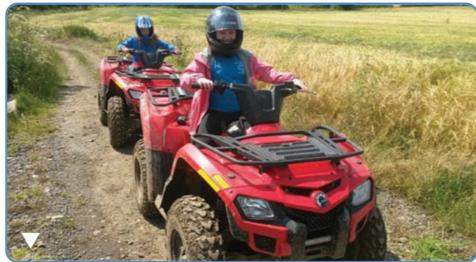
Guide and The Senior Section from South Langbaugh visited Yorkshire Outdoors and had great fun quad biking, off roading in Landrovers and on Segways.

Fun and friendship at the Wadow weekend.