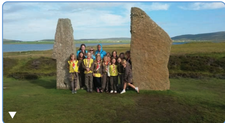
Brownies visit the beautiful island of Orkney and take in the breath-taking scenery.