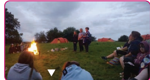
Camping at Danby.