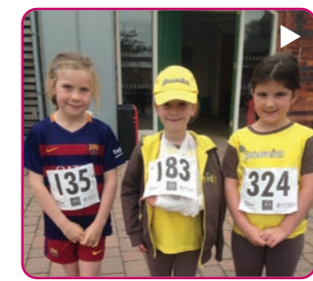
Even a broken arm won't stop a brownie taking part in a fun run.