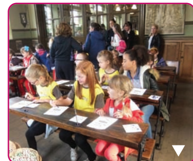
Back in time at Beamish with Middlesbrough Division.